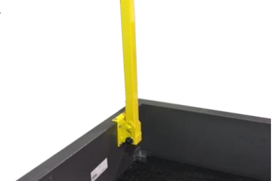
Post in Extended Position